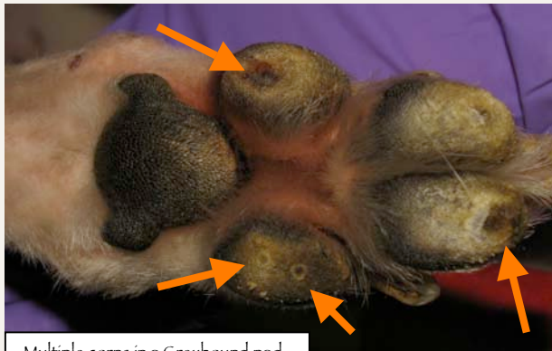
Multiple corns in a Greyhound pad

There are numerous reported ways to treat corns. Everything from application of duct tape to the corn to toe amputation has been reported. We currently use a hulling technique, sometimes followed by the application of the anti-wart medication Aldara® or Abreva®. The hulling procedure will need to be repeated as often as every 3 weeks although we have had some corns fail to re-grow following several treatments.