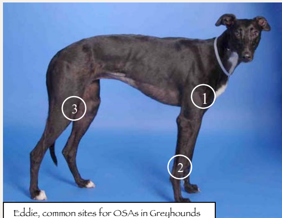
Eddie, common sites for OSAs in Greyhounds

“Although, they can affect any bone or location”.