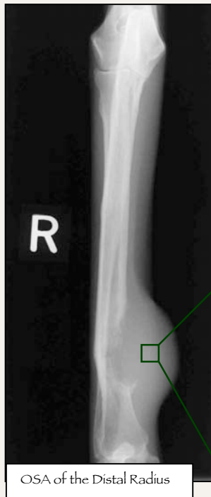
OSA of the Distal Radius

Radiographically, OSAs exhibit a mixed lytic-proliferative (destruction-production) pattern of the affected bone. Once a presumptive radiographic diagnosis has been established and if the owners are contemplating treatment, thoracic radiographs should be obtained to determine the extent of the disease. We usually obtain three radiographic views of the thorax. Only approximately 10% of dogs with OSA initially have radiographically detectable lung lesions; the presence of metastases is a strong negative prognostic factor.